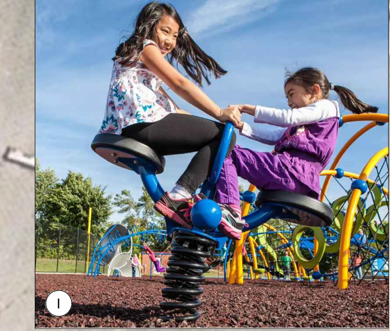
DOUBLE SPRING RIDER