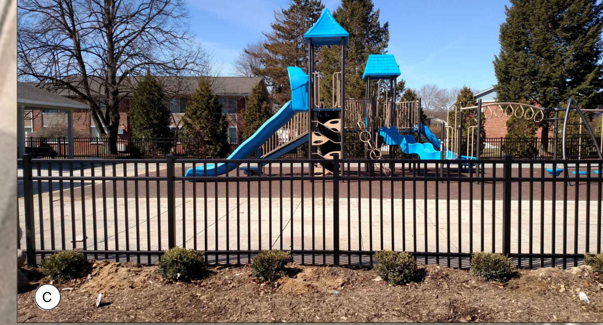
EXAMPLE PLAYGROUND FENCE