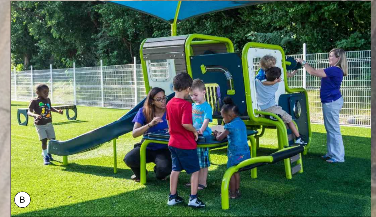
2-5 YEAR OLD PLAY STRUCTURE EXAMPLE